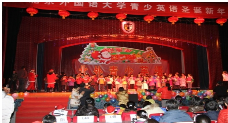
Our students and teachers are celebrating Christmas Day together