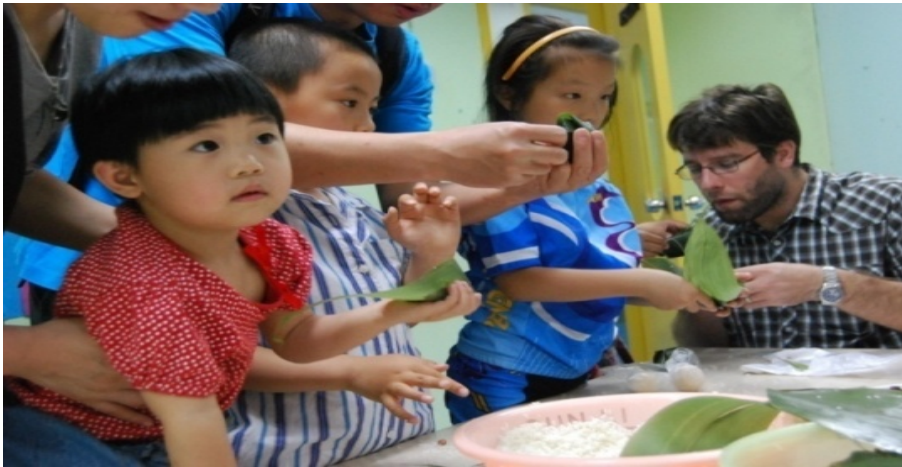
Our students and teacher are wrapping “Zongzi” together to celebrate the Dragon Festival