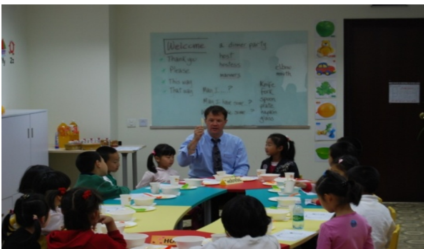
Our students are learning table manners from our foreign teachers