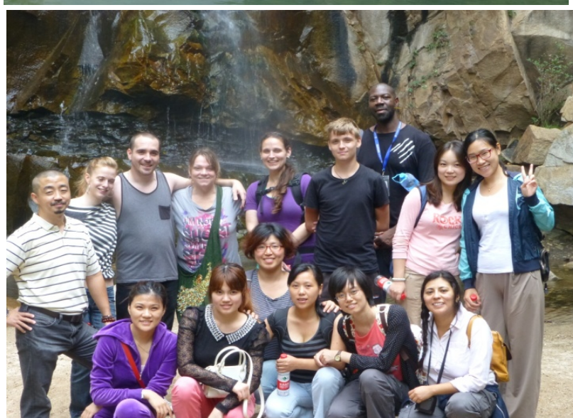
Our foreign teachers and Chinese staff are hiking at Baiquan Mountain