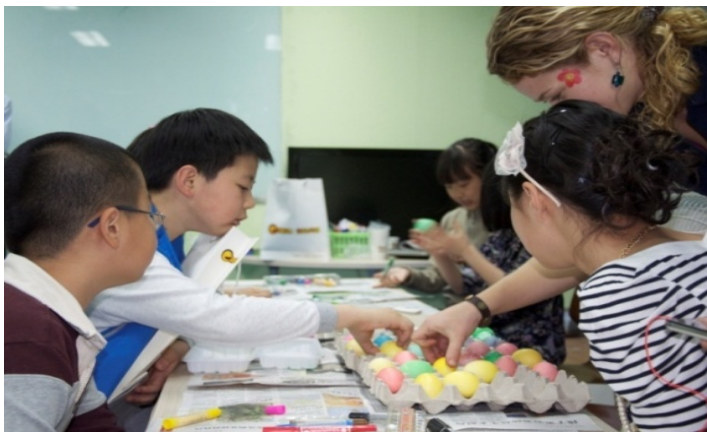
Our teacher is instructing students to make eastern egg